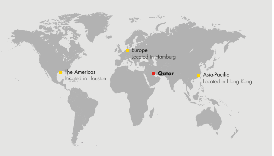
Figure 3: Shell's GTL hubs are located strategically around the globe.

Our international organisation has established a dedicated supply chain that begins with two independent production trains in Qatar, and includes three regional storage hubs in Houston, USA; Hamburg, Germany; and Hong Kong (Figure 3), as well as dedicated supply points around the world. These maintain significant buffer stocks to meet customers' requirements.